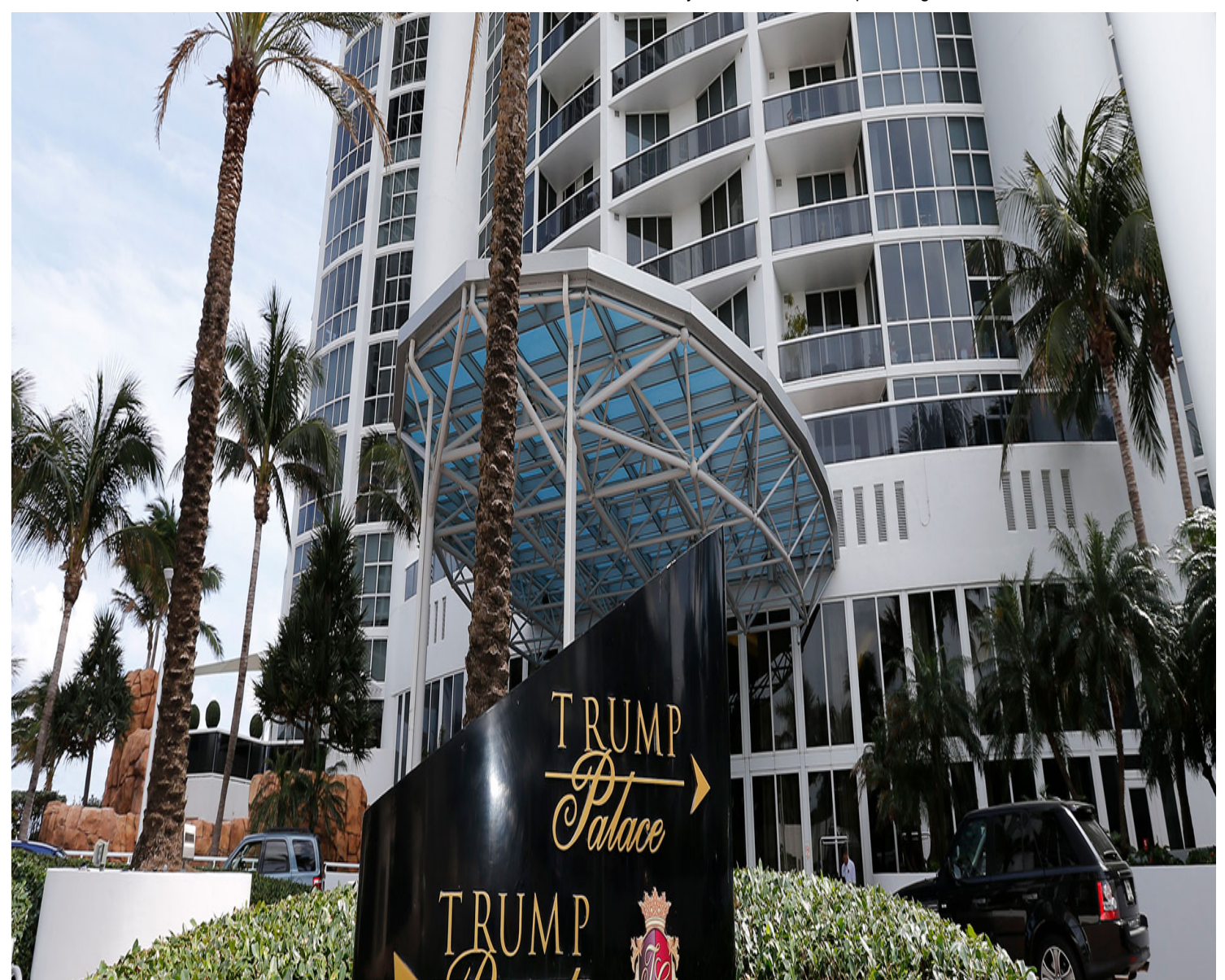
TOWERING SUCCESS: The seven Trump-branded luxury towers in south Florida have been popular with Russian investors. A look at the transactions offers a glimpse into how wealthy Russian invest overseas.