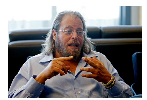
FLORIDA DEVELOPER: Gil Dezer teamed up with Donald Trump to develop six buildings in Sunny Isles Beach.

Edgardo Defortuna, a leading Miami developer, estimated that Trump likely made between one percent and four percent in initial sale commissions, based on the standard fees paid on similarly branded