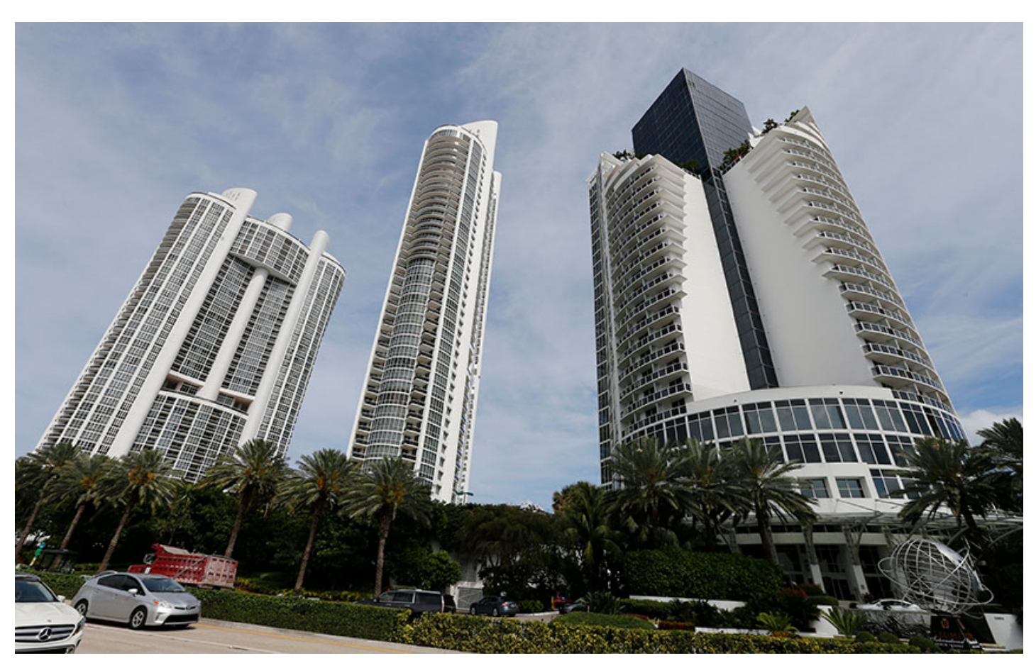
LUXURY APPEAL: From left, the Trump Royale, the Trump Palace and the Trump International Beach Resort in Sunny Isles Beach, Florida.

In 2009, Ustaev bought unit 5006, a 3-bed, 3.5-bath apartment in the Trump Palace complex in Sunny Isles, for $1.2 million in cash, according to Florida public records. Two years later, Ustaev bought another apartment, a penthouse unit, this time in the nearby Trump Royale condominium development, for $5.2 million.