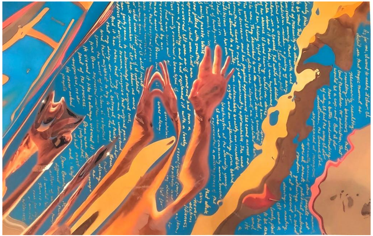
Some of Biden's works are set to be sold for upward of $500,000.