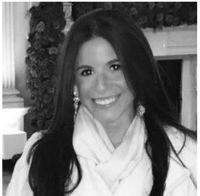
By Brooke Singman | Fox News