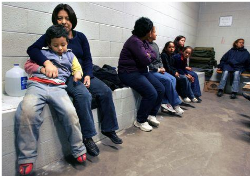
A migrant family sits inside an Immigration Detention Center in Nogales after they were detained by border patrol agents.

All this has been achieved through two mechanisms: militarization and dehumanization. In her book, Pitzer describes camps as “a deliberate choice to inject the framework of war into society itself.” These kinds of detention camps are a military endeavor: they are defensible in wartime, when enemy combatants must be detained, often for long periods without trial. They were a hallmark of World War I Europe. But inserting them into civil society, and using them to house civilians, is a materially different proposition. You are revoking the human and civil rights of non-combatants without legal justification.