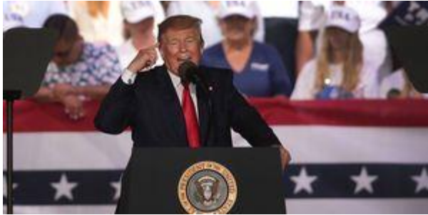
Donald Trump 'Joked' in Response to 'Shoot 'Em'

All this has been achieved through two mechanisms: militarization and dehumanization. In her book, Pitzer describes camps as “a deliberate choice to inject the framework of war into society itself.” These kinds of detention camps are a military endeavor: they are defensible in wartime, when enemy combatants must be detained, often for long periods without trial. They were a hallmark of World War I Europe. But inserting them into civil society, and using them to house civilians, is a materially different proposition. You are revoking the human and civil rights of non-combatants without legal justification.