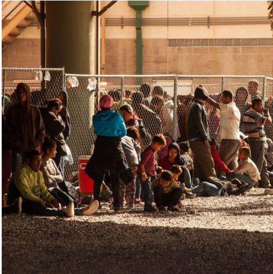
Migrants awaiting processing are held in temporary fencing underneath the Paso Del Norte Bridge on March 28, 2019 in El Paso, Texas. ADVERTISEMENT - CONTINUE READING BELOW

Again: these are inhuman conditions, and crystalize the dehumanization. So, too, does the Trump administration's decision, reported by The Washington Post , to cancel classes, recreational programs, and even legal aid for the children held at facilities for unaccompanied minors. Why should these kids get to play soccer or learn English? Why should they get legal assistance? They're detainees.