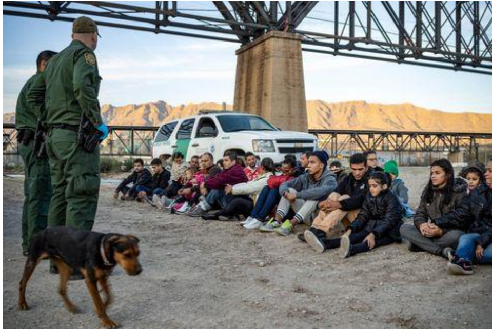
Border agents detain a group of migrants.